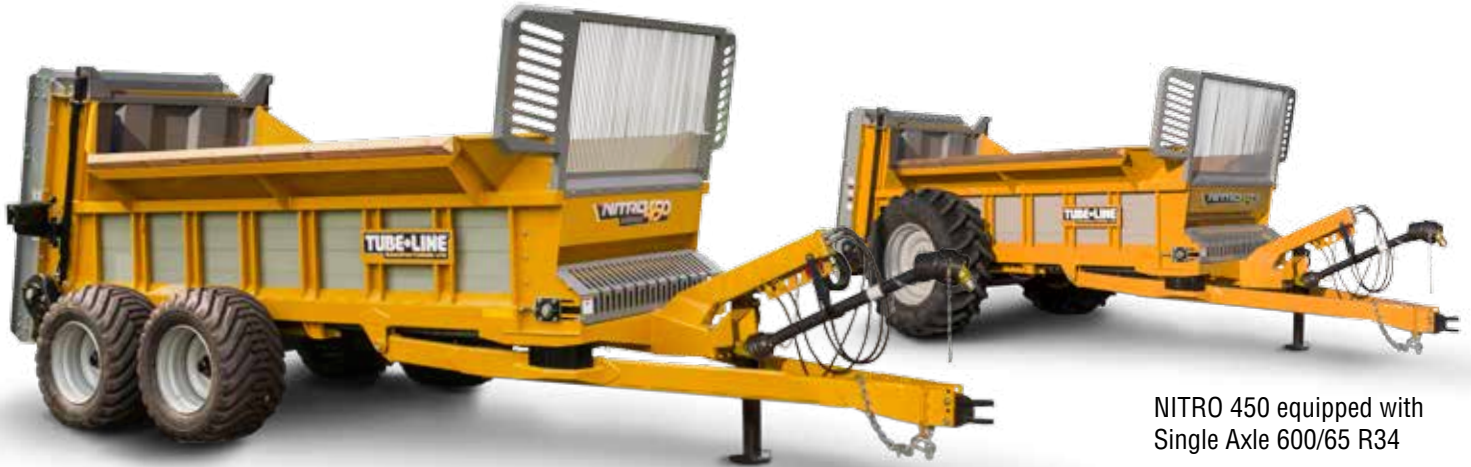
NITRO 450 equipped with Tandem Axle 550/45 - 22.5