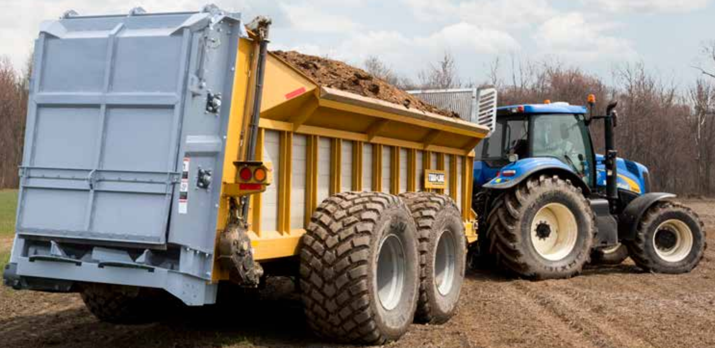
NITRO 950 shown with optional Poultry Beater Assembly