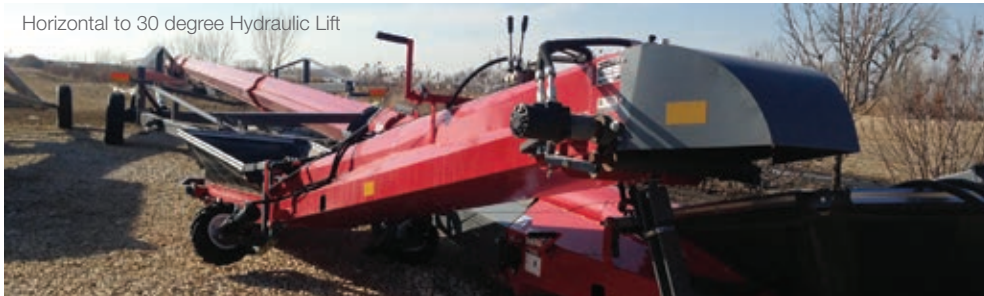
Horizontal to 30 degree Hydraulic Lift