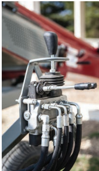
Convenient Joystick Controls