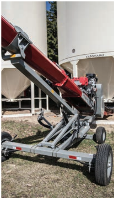
Heavy Duty Mover