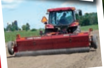
Agricultural & Landscape Seeders