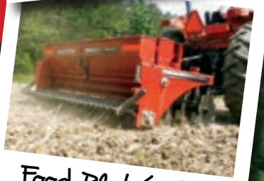
Food Plot Seeders