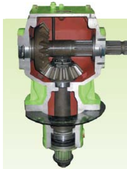
Heavy Duty Gearbox