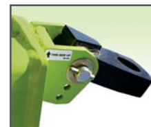
Solid Tongue Hitch