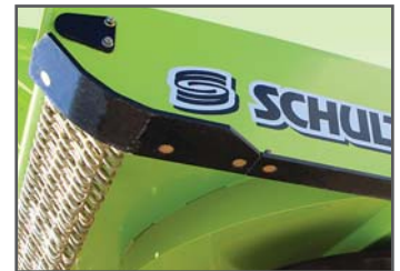
2 Piece Replaceable Skid Shoes