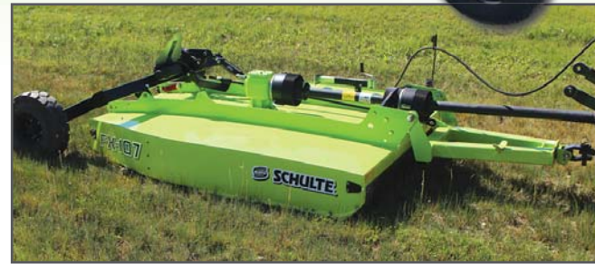
Trailing Unit Shown