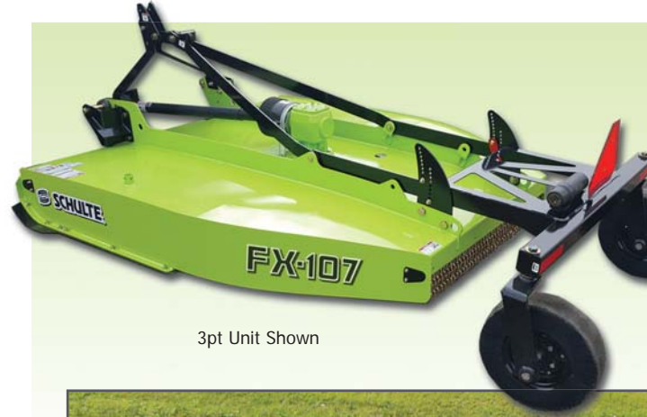
3pt Unit Shown