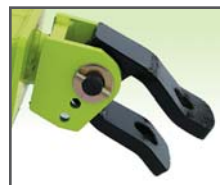
Open Clevis Hitch