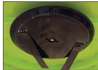
Heavy Duty, Spun Formed Stump Jumper Pan