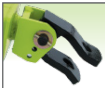
Open Clevis Hitch