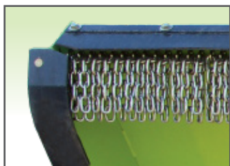
Moveable Skid Shoes / Safety Chains