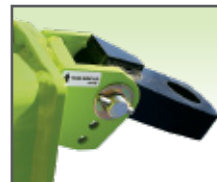
Solid Tongue Hitch