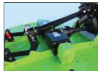
Three Point Hitch